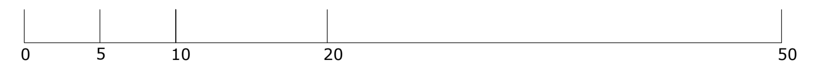
SCALE BAR 1:250

Job NEW DWELLINGS LAND TO THE REAR OF 2 SAXON CLOSE Dwg SITE PLAN AS PROPOSED Client MR R GAWTHROP 2 SAXON CLOSE, EXNING Date JUNE 2018 Scale 1-200/1-1250 Job No 60443 Dwg No (0-)101 Rev No P2